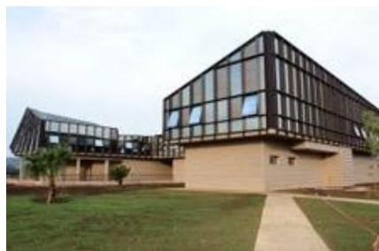
School of Mines and Metallurgy, Moanda, Gabon