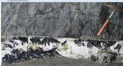
Quartz-wolframite vein from Panasqueira deposit