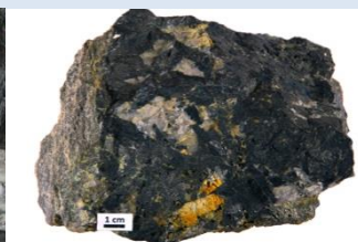
Massive wolframite from Puy-les-Vignes